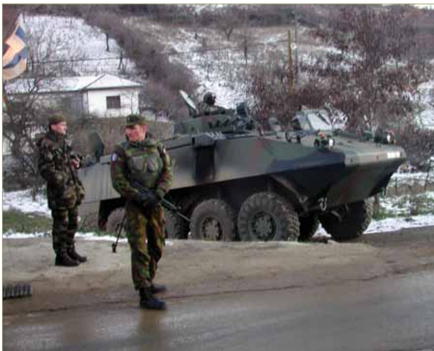
Irish and Finnish troops taking part in a joint checkpoint near the village of Janjevo.