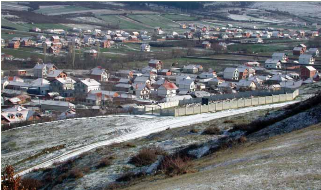
Slovinje from a nearby hill: To the right is the graveyard, the dark plaque has the names of those massacred in 1999 inscribed on it.

Entire families must survive on as little as €60 a month. The villagers collect plastic bottles to burn for the winter to substitute often meagre supplies of wood.