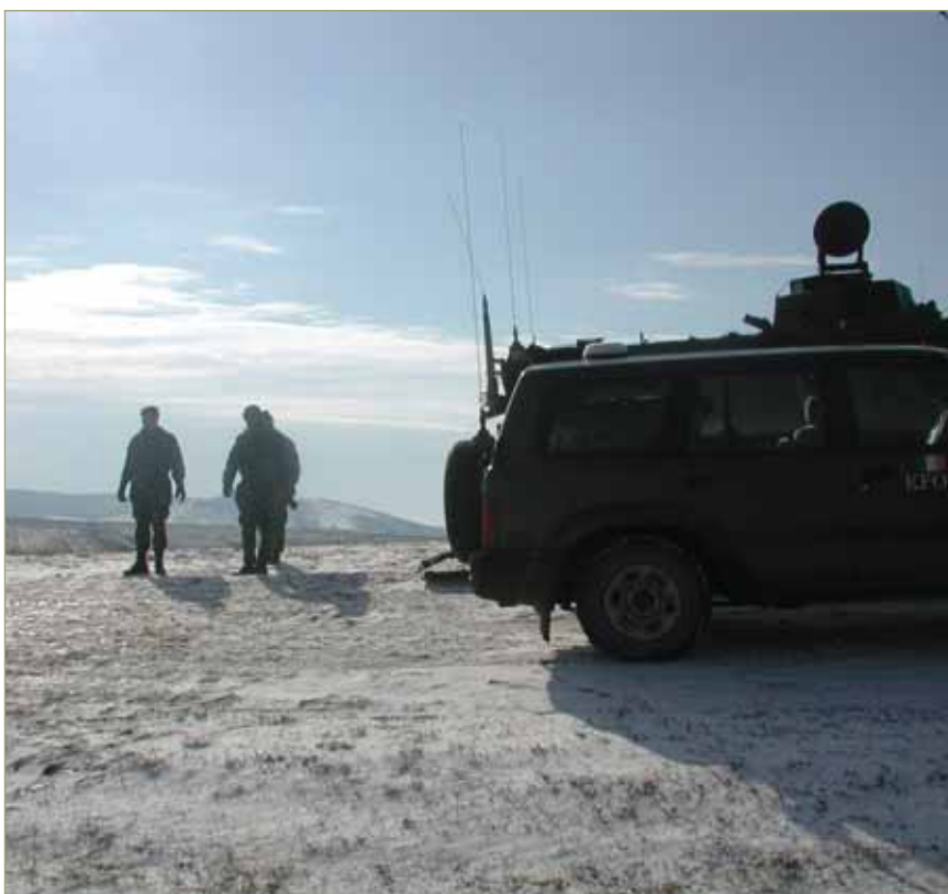
Irish MOWAG patrol near Slovinje.