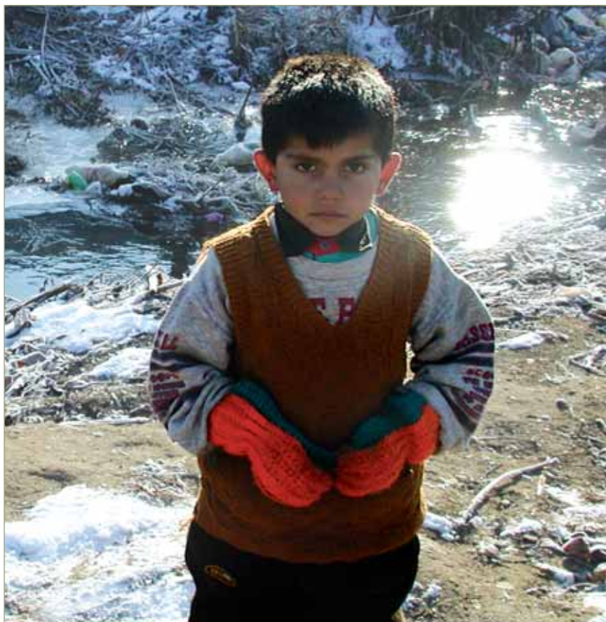
An Askali child in Gornje Gadimjle. The poverty in Irish patrolled areas can be extreme.

The people killed on the first day of the massacre were exhumed and placed in an old school for families to identify. Those killed on the second day were placed in a mass grave by the Serbs, when the Albanians returned to take the bodies back to the village, the mass grave was empty. To this day those 18 bodies have not been found. It is believed that the Serbs moved the bodies to a hidden location. Many Albanians were too frightened to return to Slovinje. Only in June, when KFOR arrived