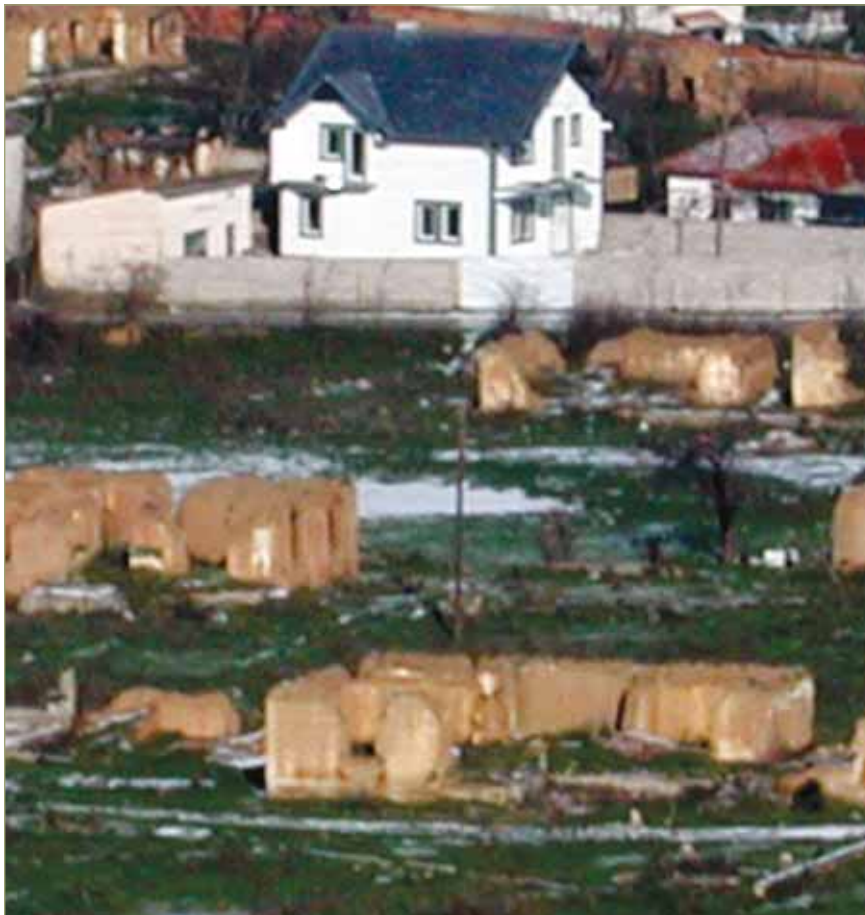
Ethnic cleansing: After Albanians returned to the village of Slovinje, they destroyed these Serbian houses.