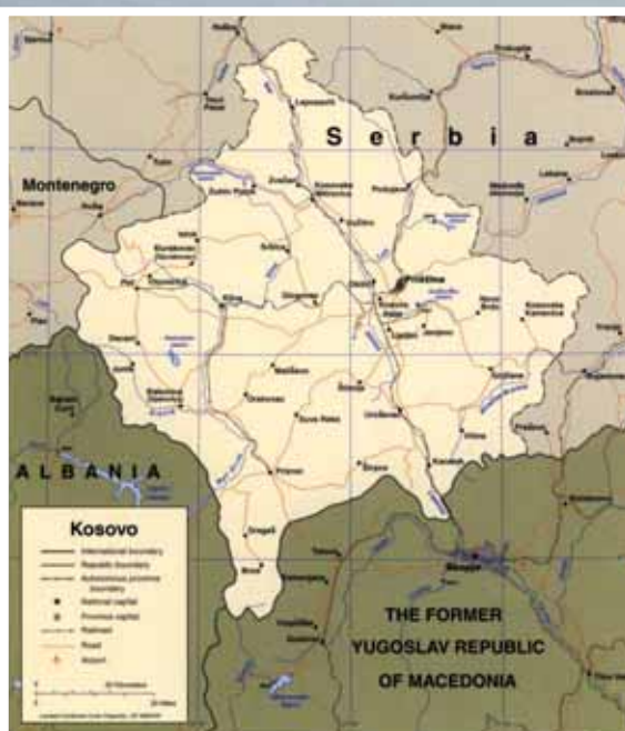
Camp Clarke, Kosovo