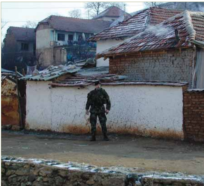
Irish troops on patrol in Gornje Gadimlje.

of accumulated overseas experience since 1958. But this is a NATO mission, and that's a first for us. This is the first time we've been involved in this type of structure under the flag of NATO. That is a particular challenge as we've had to adapt NATO terminology and NATO procedures. On top of that we had to adapt to the particular peace-support requirements of this mission."