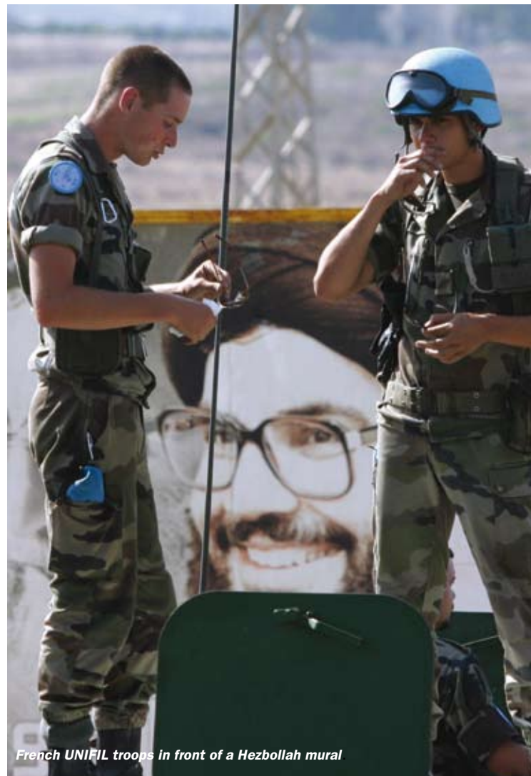
French UNIFIL troops in front of a Hezbollah mural

The new Cell, by contrast, has operational authority and is not a political talking-shop. And so far it has been tested by only sporadic minor challenges from Hezbollah and Israeli over-flights. But the early experiences of UNIFIL raise doubts for the future: if a deteriorating security situation in the Middle East meant that the current mission was to enter a sustained “harassment period”, how would the EU contributors use the Cell? Would it be a mechanism to coordinate an effective containment of the challenge – or would governments start to pile up new conditions and caveats on the