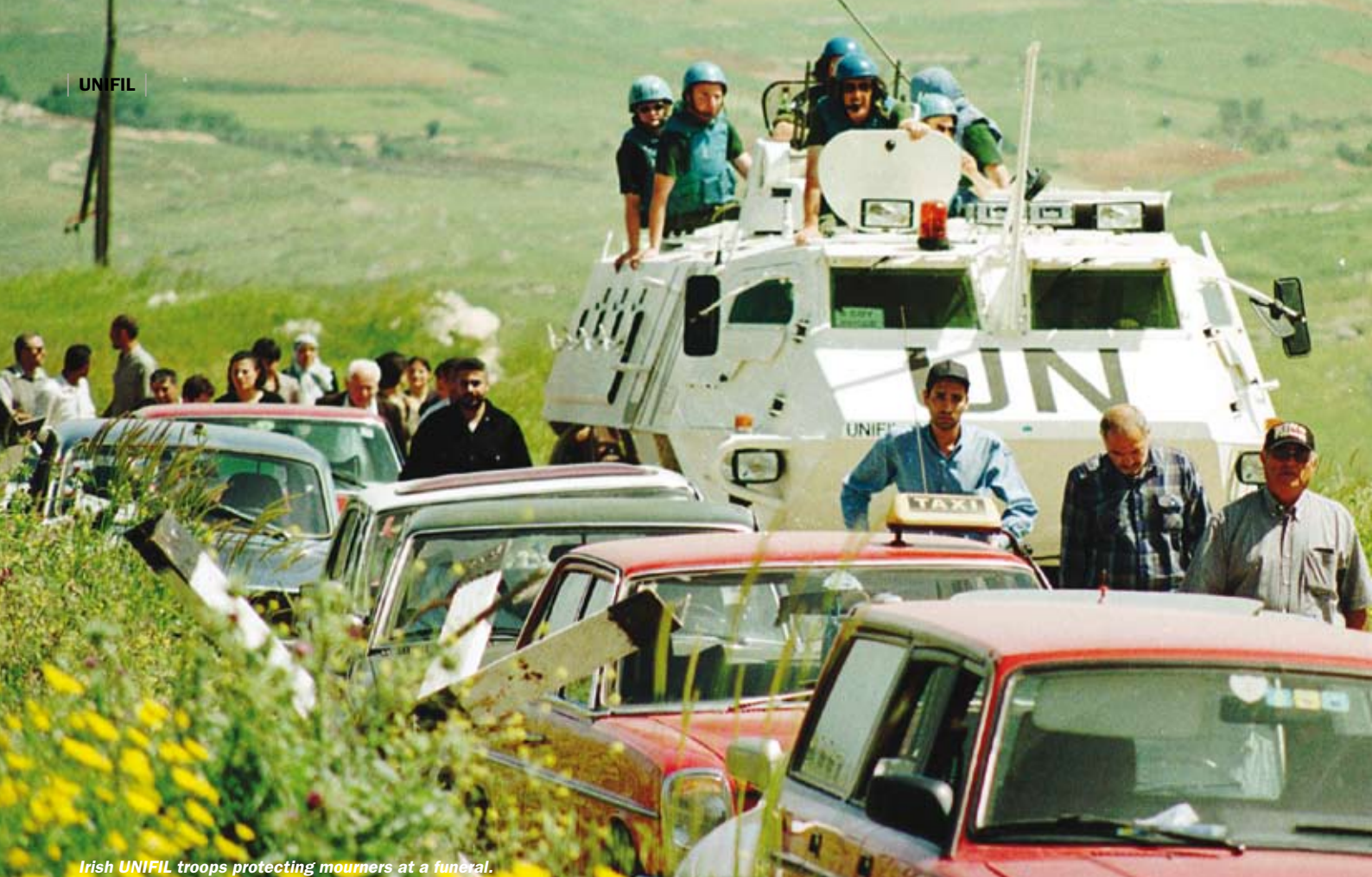
Irish UNIFIL troops protecting mourners at a funeral.

those years the “harassment period”. This is putting it mildly. UNIFIL was not merely obstructed but outright attacked by the Palestinian Liberation Organization and pro-Israeli militia. The latter even mounted an artillery assault on the UN’s main base and hospital. Restrained by their Chapter VI mandate, and with little in the way of robust forces or operational intelligence to go, UNIFIL’s contingents inevitably took casualties. The murder of three Irish soldiers in April 1980 by pro-Israeli militias was a cold-blooded atrocity. The memories remain strong: in the five years immediately prior to the 2006, the reduced UNIFIL did not lose any personnel to hostile acts, but UN Secretariat staff still described it as one of the most dangerous missions.